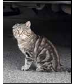
Right: Stallone Loved by Many FP Residents