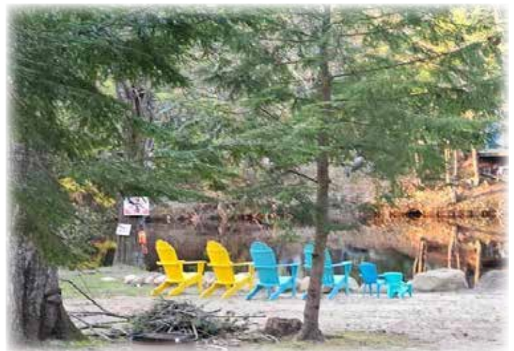
A couple of pictures of the campground where we are in Lee, N.H.