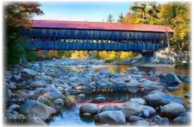
One of New Hampshire's famous covered bridges.

To receive a username and password, contact the FPPOA office. ( fpoainc@gmail.com ) If you need further information, contact me at webmaster@forestparkonline.com .