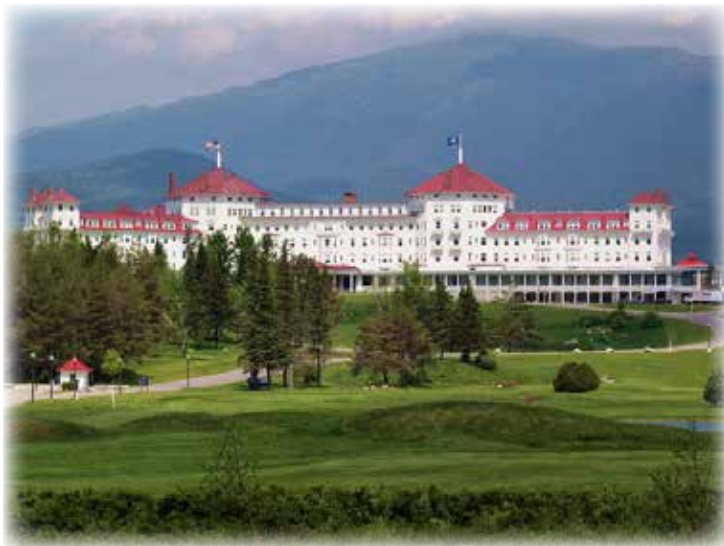
The Omni Mount Washington Hotel, Bretton Woods in the beautiful White Mountains of N.H.