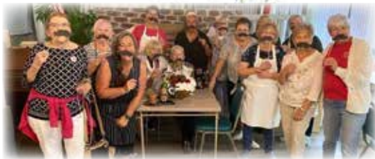
Part of the Lasagna Dinner Crew!