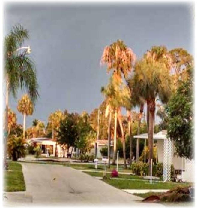
Sunset on Timber Lane