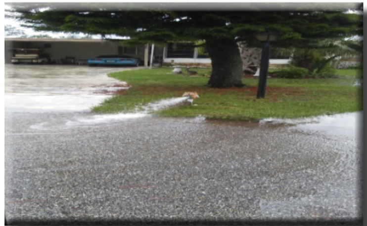
Pumping water in Forest Park