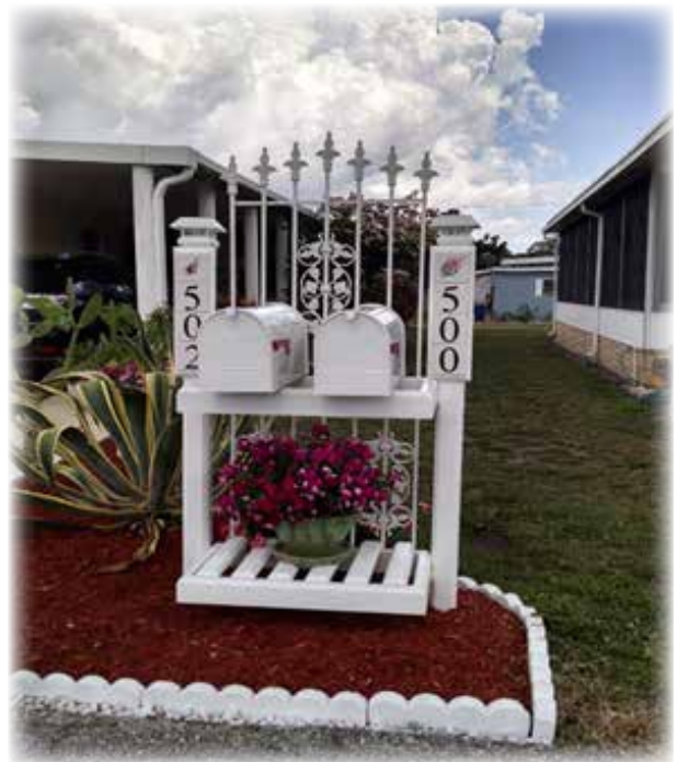
Lovely mailboxes on Pine Tree