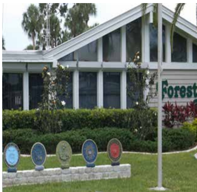
Magnolia Trees in bloom behind the Military signs