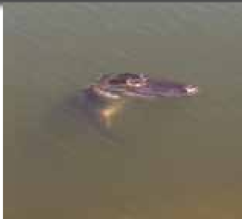
Our newest resident that has traveled from Peace Lake to Hollyberry and back to Peace Lake.