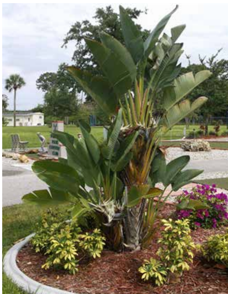
White Bird of Paradise in bloom at the Country Club Hole # 1