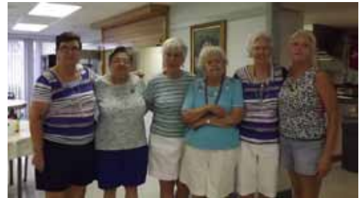
The Committee that made it happen.