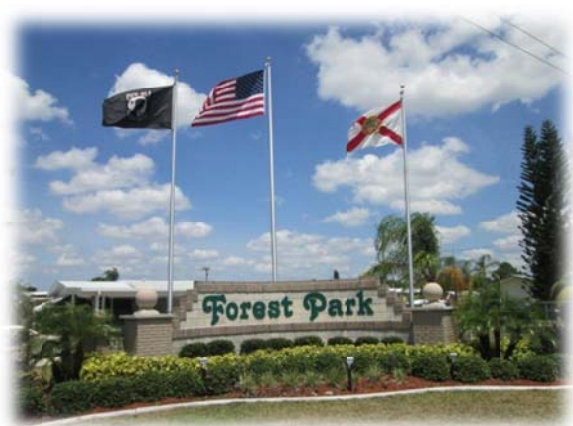
The POW, American Flag and State of Florida flag flying high and proud as Memorial Day 2014 ends.