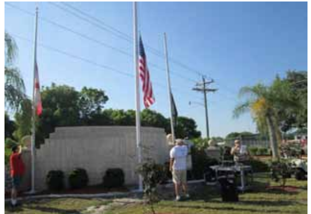
All salute our American Flag at half-mast.