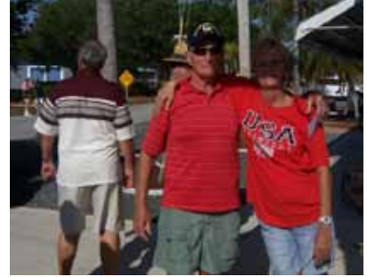
They came by golf carts, bicycles and on foot.